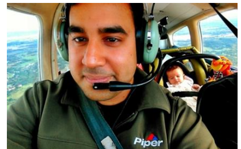
Young client with Hope Air volunteer pilot on the way to the hospital